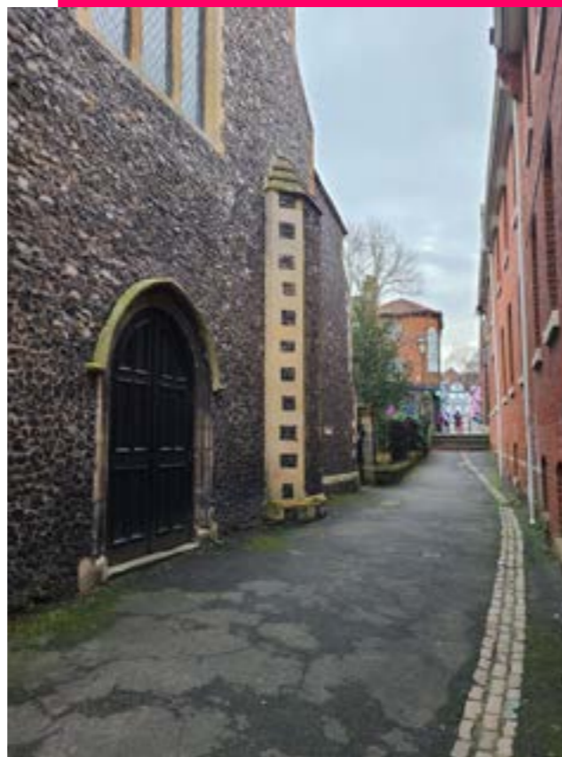
LOAD IN DOOR