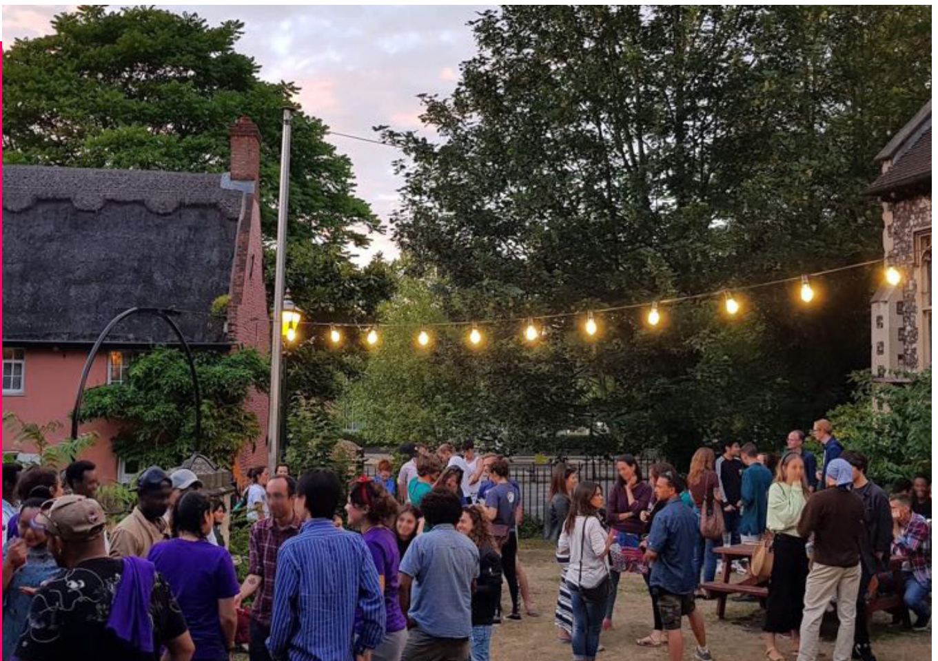
OUTSIDE BAR SEATING AREA

5pm is the earliest time that sound checks can take place 11pm Sunday - Thursday, and 12am Friday & Saturday are the latest times