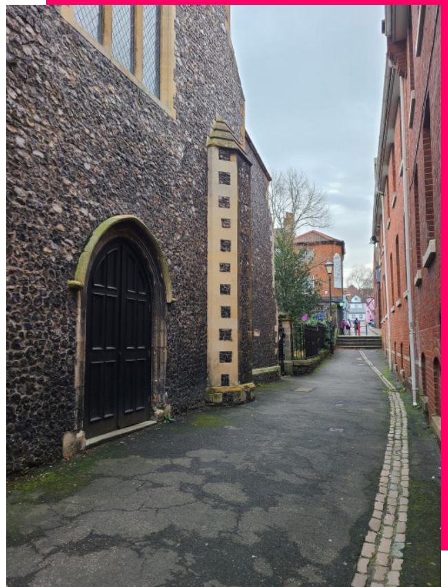
LOAD IN DOOR