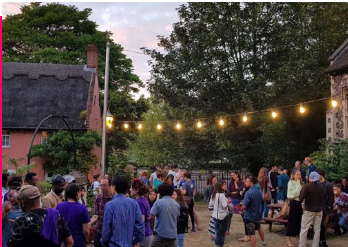
OUTSIDE BAR SEATING AREA

5pm is the earliest time that sound checks can take place 11pm Sunday - Thursday, and 12am Friday & Saturday are the latest times